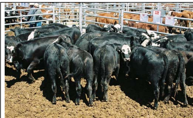
The $860 top pen of Simmental/Angus weaner heifers at Naracoorte on Feb 9