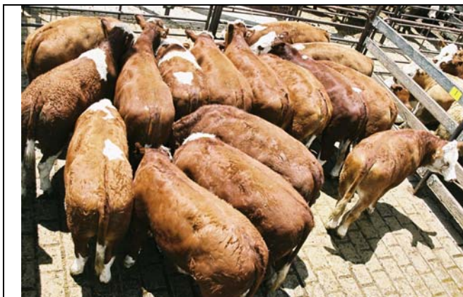
The $755 top pen of Simmental/Poll Hereford steer weaners at Naracoorte on Jan 19