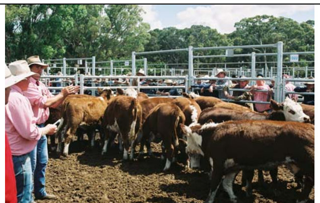
A pen of Simmental/Poll Hereford weaner heifers at Naracoorte on Feb 9

In an earlier Naracoorte weaner sale (19 th January), the Bakers sold 435 head of similarly bred Simmental cross weaner steers to a top of $755 per head. Their average was $674 or 343 kg @ 196.6 c/kg.