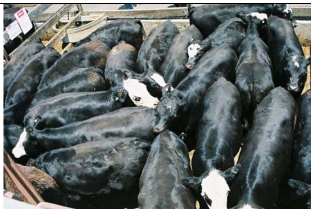
An outstanding pen of Simmental/Angus steer weaners at Naracoorte on Jan 19